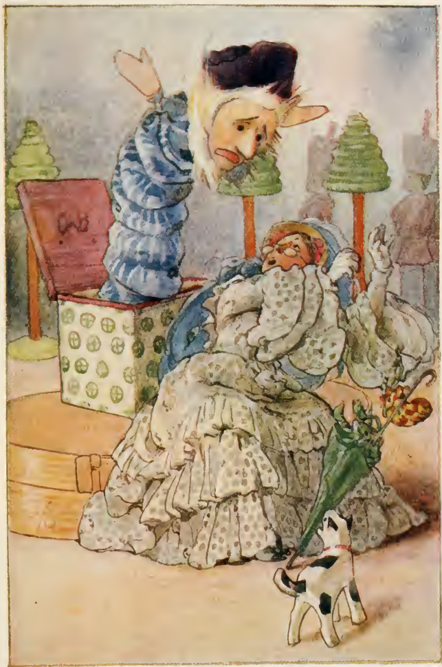
The Land of Lost Toys (p. 72).